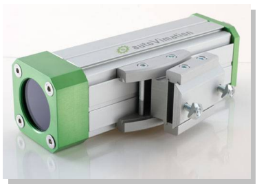
Mounting Kit 7