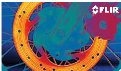
Motorcycle brake testing