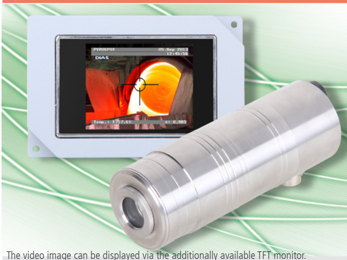
The video image can be displayed via the additionally available TFT monitor.