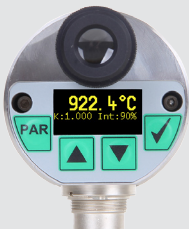
Optical through-lens sighting or electronic viewfinder