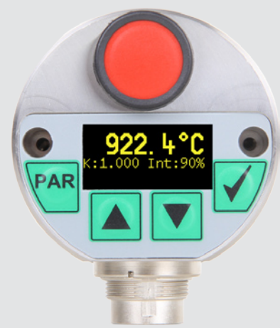
laser aiming light