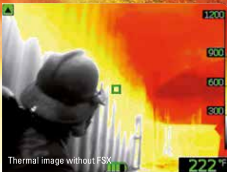
Thermal image without FSX