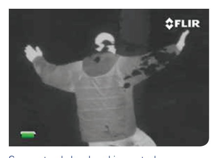
Suspect subdued and in custody

Visit www.FLIR.com/LSSeries for more information, including a product selector guide, interactive simulator, case studies, videos and more.