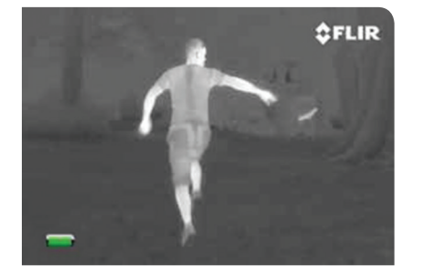
Assailant trying to dispose of evidence

No matter how clever a suspect may be, they can't hide their heat. Rather than rush on the scene with a flashlight that instantly gives away your position and only illuminates your immediate area, FLIR LS is just as portable, and exponentially more effective. Search the scene for discarded evidence in pitch black conditions where traditional night vision fails. You can see through smoke, dust and light fog. Even light foliage and camouflage are powerless against thermal imaging. Take away every hiding spot with FLIR LS Series.